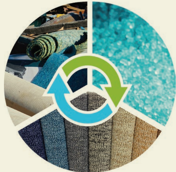
Figure 1: The concept of the ISOPREP project.

Approximately 8.3 billion metric tons of plastics have been produced worldwide since 1950, less than 20% of which have been recycled or incinerated, leaving about 80% to accumulate in the environment. The million tonnes of plastic litter that end up in the landfills and oceans are the most visible signs of the environmental problems caused by plastics, which have also triggered growing public concern. Given these environmental problems and the ever increasing demand for plastics, there is an urgent need for new innovative recycling methods that will not only help protect the environment by eliminating waste and reducing greenhouse gas emissions and dependence on fossil fuels but also contribute to the circular economy by upcycling and by maximizing the value of